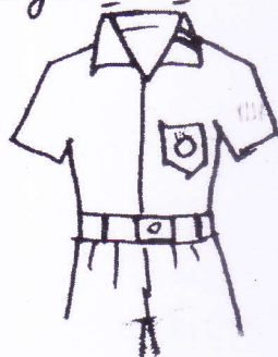
Diag. 5. Boys XI-XII