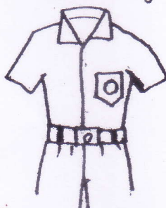
Diag. 2. Boys I-X