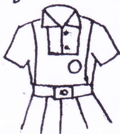
Diag. 1. Girls I-V